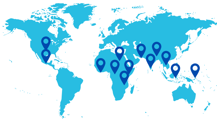
LOCATIONS OF PROJECTS ADDRESSING SDG 6 INCLUDED IN DATABASE

These events, bred by intense rainfall, accelerated glacial melt, and prolonged heat waves, underline delicate yet critical relationships with water in our human and non-human communities. While 6.4 billion people have basic water supply, fewer than 5.2 billion access a safely managed system, resulting in hundreds of deaths everyday due to preventable water and sanitation-related diseases. Community resilience development requires Indigenous knowledge, local knowledge and technical knowledge and the cooperation and coordination of actions among multiple actors at all levels. Around the world, faith-based organizations are actively providing life-saving education and on-the-ground support to implement WASH (water, sanitation and hygiene) practices. At the same time, we witness how religious communities are working to protect oceans, seas, lakes, rivers, streams, and glaciers. As we continue to honor and protect water as a priceless, sacred element on which our lives depend, let us celebrate the good work of projects shared here.